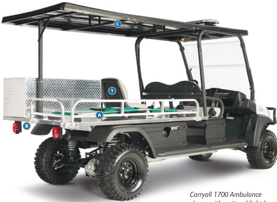
Carryall 1700 Ambulance shown with optional light bar.