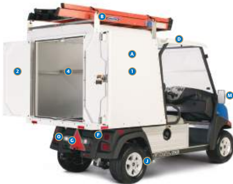
Carryall 500 shown with optional wheel covers.