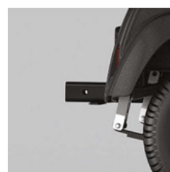
Rear Receiver Hitch