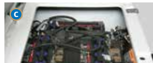
Single Point Watering System