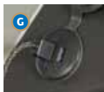
Dual USB Port