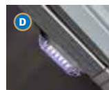
Van Box LED Lighting