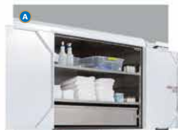
Drawers and shelving for lots of storage

The vehicle comes with a standard dark gray body and gray seats. Optional colors are available. Visit www.clubcardealer.com to find your local Authorized Club Car Dealer and learn more.