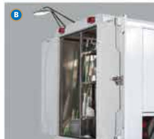
Deep well cabinet for large items