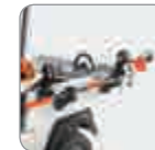
Upper & Lower Tool Holder Kit