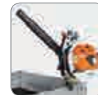
Backpack Blower Rack