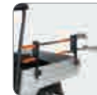
Multi-Tool Holder Kit