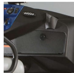
Lockable Glove Box