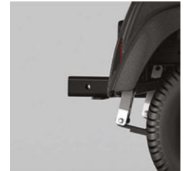
Rear Receiver Hitch