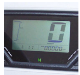
Instrument Panel (Standard)