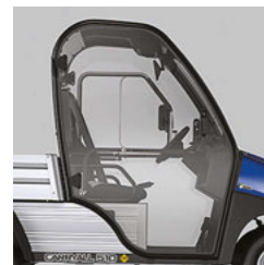
Cab Glass Doors