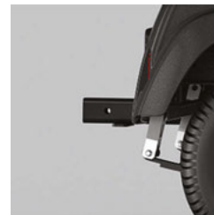
Rear Receiver Hitch