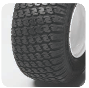
Extra-Traction Turf Tires