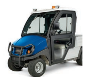
ROPS Cab (Front Hinge Door)