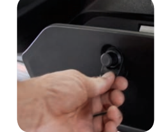
Locking Glove Box