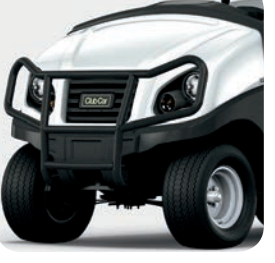
Heavy-Duty Brush Guard