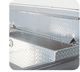
Cargo Tool Box