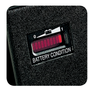
Battery Capacity Indicator