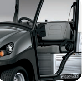
Cab Outside Mirrors