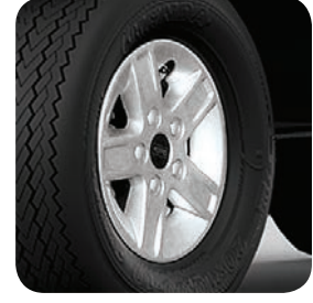
5-Spoke Wheel Cover