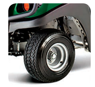
Small Wheel Package