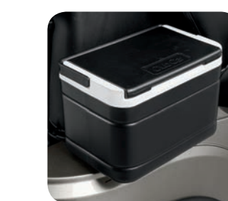
Caddy Master Cooler