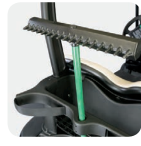
Sand Trap Rake Kit