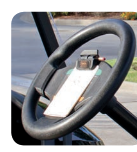
Comfort Grip Steering Wheel