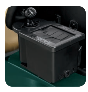
Ball and Club Cleaner