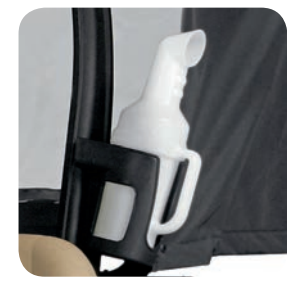
Divot Repair Sand Bottle