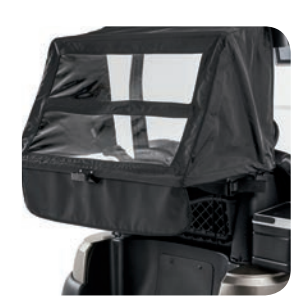
Bag Cover with Magnetic Latch