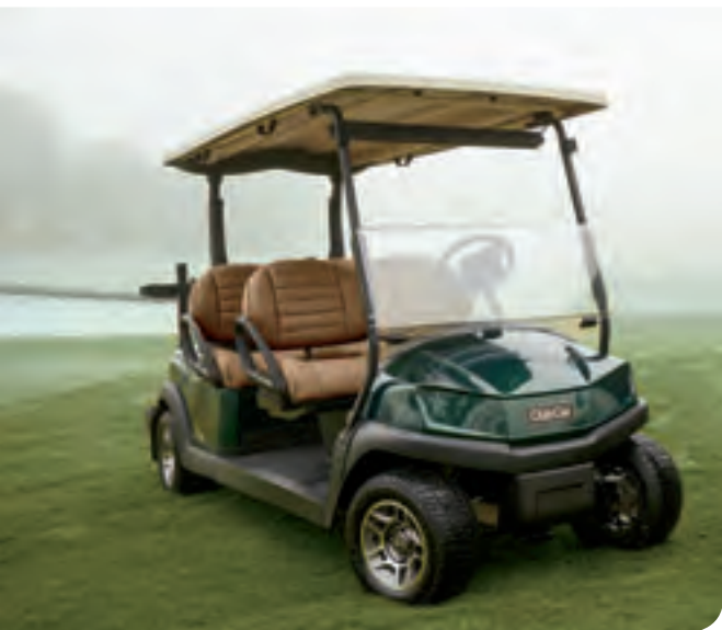
Tempo 4Fun – Built for 4 passengers

The award-winning Tempo continues to exceed industry expectations, delivering a smooth, comfortable ride and connected touchscreen technology no other golf car can match. With a distinctive design and golfer-first features, it's available in 2- or 4-passenger models, with a standard electric engine or an energy-saving Lithium Ion battery—and can be endlessly customized to suit your course's needs.