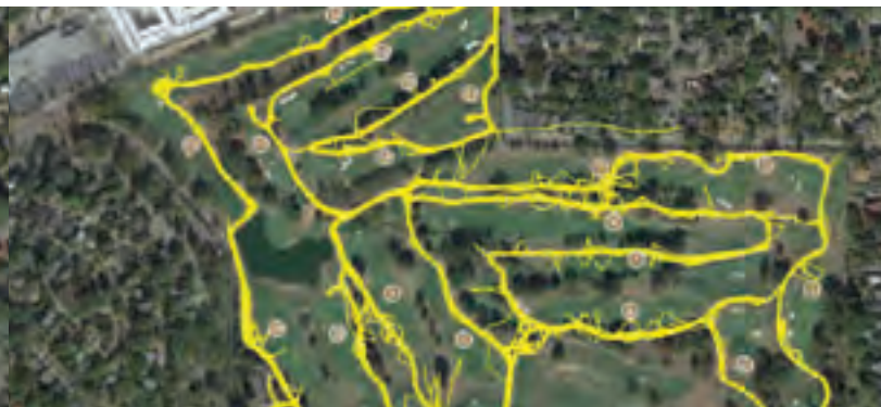
Heat map of a course after Car Control's cart path implemented.