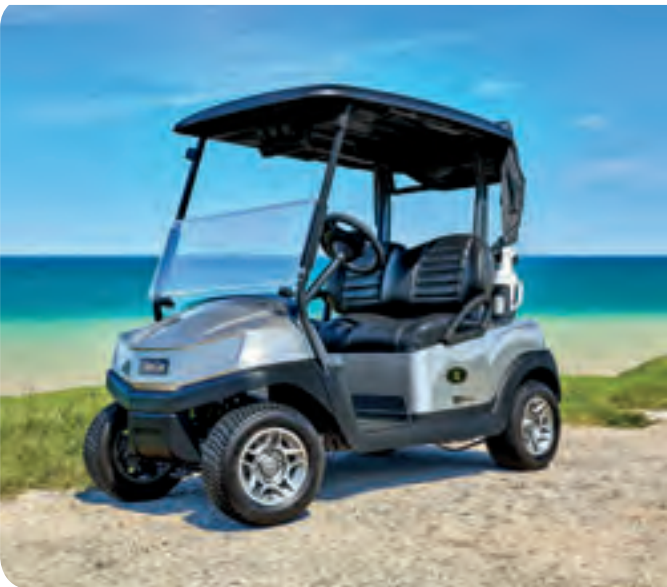
Tempo Li-Ion – Built for efficiency

High-performing and packed with the latest technology, our Lithium Ion golf cars save time, increase car reliability, and conserve energy to improve the overall performance of operations. When it's time to power up, the fast charging times and ability to hold a charge across multiple rounds keep Lithium Ion-powered cars on the course and out of the barn.