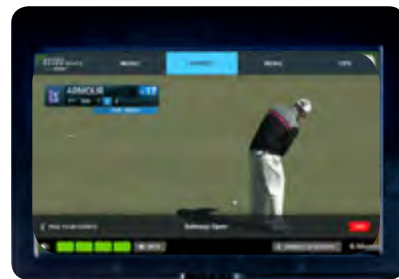
Club Car Connect with Shark Experience