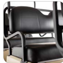
Easy-to-Clean, Durable, Marine-Grade Vinyl Seats