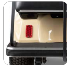
LED Tail Lights and Turn Signals standard