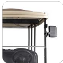
Multiple options available to enhance style and comfort