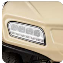
LED Headlights with Daytime Running Lamps standard

The new Villager includes safety-enhancing features such as LED headlights (with daytime running lamps), a four-wheel braking system, turn signals, tail/brake lights, and a horn to ensure that your guests arrive safely.