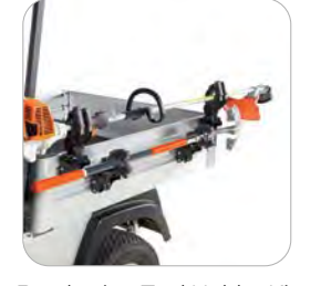
Ratcheting Tool Holder Kit (Upper) & Standard Tool Holder Kit (Lower)