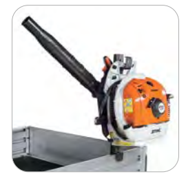
Backpack Blower Rack