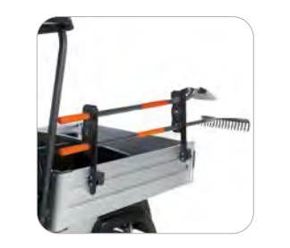
Multi-Tool Holder Kit