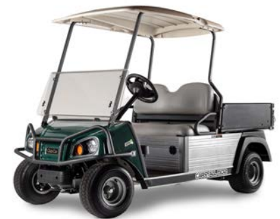
Carryall 502 Slim

Designed for rental fleets, the Carryall 502 with Narrow Bed can be fit side by side on trailers to fit more vehicles when delivering a rental fleet.