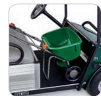
Spacious Interior means plenty of room for equipment.