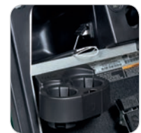
Console with Standard Dual USB & Multi-Use Cup Caddy keeps devices charged and drinks, radios, and tools secure.