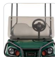
Low Profile Dash enhances sight lines for an unobstructed view. *Optional windshield available

Designed for rental fleets, the Carryall 502 with Narrow Bed can be fit side by side on trailers to fit more vehicles when delivering a rental fleet.