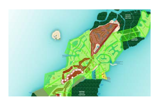
CAR CONTROL MODULE

Visage Fleet Management is a proven technology focused on building relationships with commercial fleet managers. It brings an exclusive way to monitor the health of your fleet, maintain geographic boundaries, and communicate directly to vehicles.