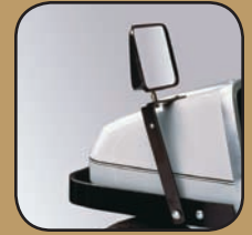
West Coast Mirror/ Heavy-Duty Bumper