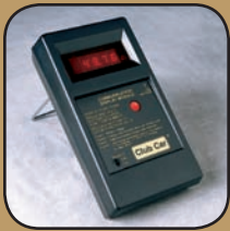
Communication Display Module