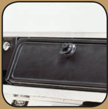
Glove Box With Lock