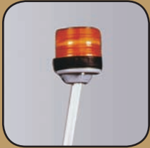
Post-Mounted Safety Strobe