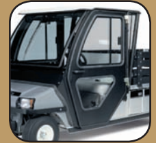
Certified ROPS Cab Enclosure