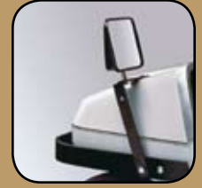
West Coast Mirror/ Heavy-Duty Bumper