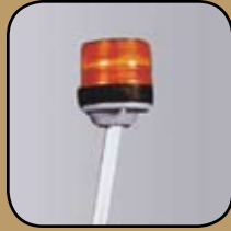
Post-Mounted Safety Strobe