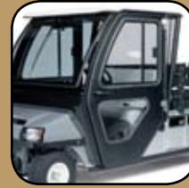
Certified ROPS Cab Enclosure