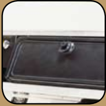
Glove Box With Lock