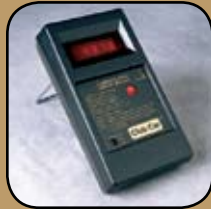
Communication Display Module