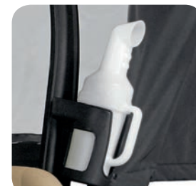
Divot Repair Sand Bottle