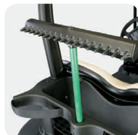
Sand Trap Rake Kit