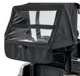
Bag Cover with Magnetic Latch