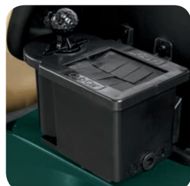
Ball and Club Cleaner