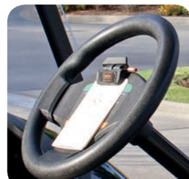
Comfort Grip Steering Wheel