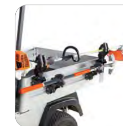
Ratcheting Tool Holder Kit (Upper) & Standard Tool Holder Kit (Lower)