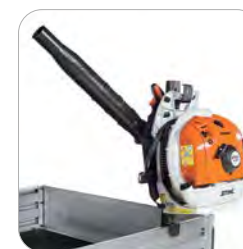
Backpack Blower Rack