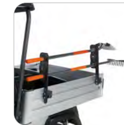
Multi-Tool Holder Kit