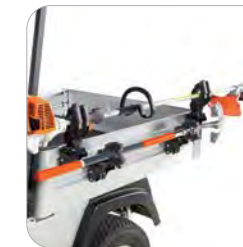
Ratcheting Tool Holder Kit (Upper) & Standard Tool Holder Kit (Lower)