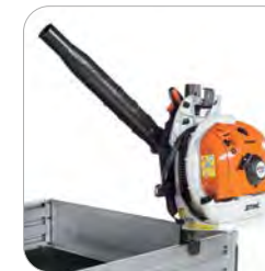
Backpack Blower Rack